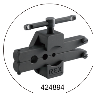
Clamp with Flaring Bar (1/4" , 3/8" , 1/2")