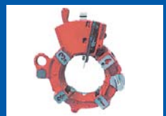
Self-opening die head (for 2½"-3" pipe) NP80AV III