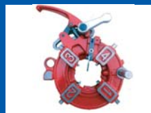
NV-auto die head (for ½"-2" pipe) NP80AV/AV III