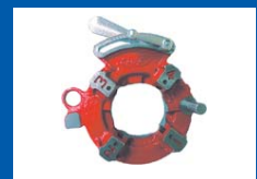
Manual die head (for 2½"-3" pipe) NP80A/AV