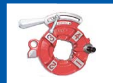
Manual die head (for ½"-2" pipe) NP80A