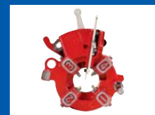
Uni-auto V die head (for ½"-2" pipe) NP80AV/AV III