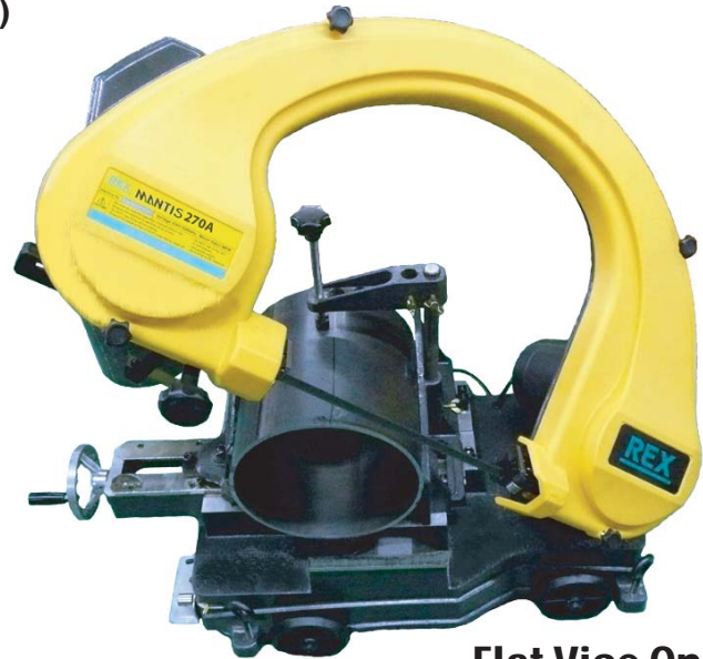
Flat Vice Only