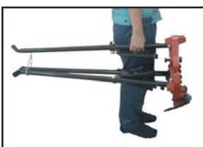
Folded for storage, etc.

Reliable work starts from having dependable tools to work with. Made for outstanding durability and functionality, the CVX6 also offers robust reliability.