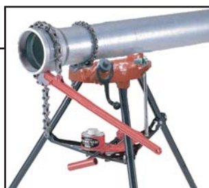
The CVX6 in actual use