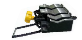
CHAIN VICE UNIT 475190