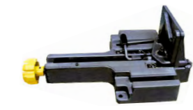
FLAT VICE UNIT 475192