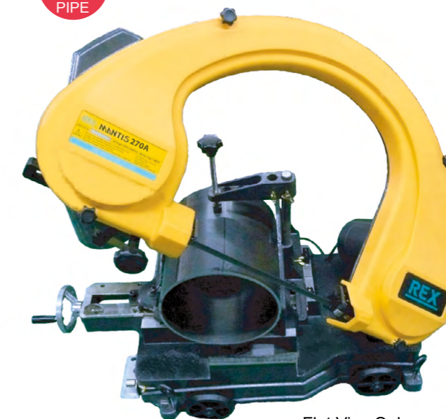
Flat Vice Only