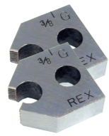
2RG Dies 10A 154003