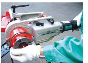
Mini power drive in action

Lightweight and portable, the Rex Mini Power Drive can thread up to 2" diameter pipe or conduit and 1" bolt or rod in just seconds. Accepts 12R die heads with adapter. Requires only 1 1/4" clearance for working in trenches, overhead and in tight quarters. Mechanical high speed reverse speeds up removal after threading.