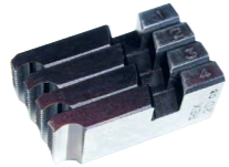
112R Dies 10A 150003