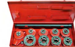
12R BSPT 112051