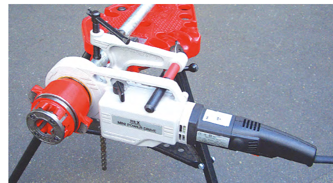
Full view with REX VICE STAND CVX6

Lightweight and portable, the Rex Mini Power Drive can thread up to 2" diameter pipe or conduit and 1" bolt or rod in just seconds. Accepts 12R die heads with adapter. Requires only 1 1/4" clearance for working in trenches, overhead and in tight quarters. Mechanical high speed reverse speeds up removal after threading.