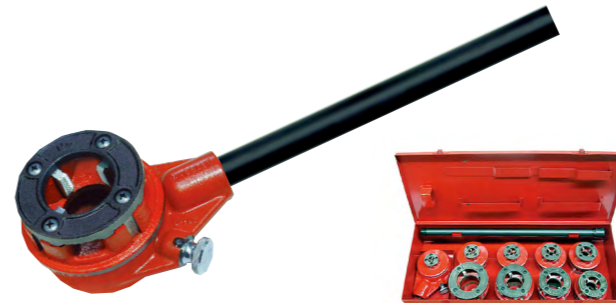
With 11/2" Drop Head

Rex Drop Heads and Dies are ideal for in-place threading from 1/8" - 2" and are designed to fit Rex Ratchet Handle 112162 (BSPT) / 112160 (NPT) as well as Wheeler Ratchet Handle 43310, and other models, such as 12R, 00-R, 111-R, 0-R, 30A & 31A, 600 & 700 Power Drives, DHR 12 Series Drop Heads and BT 40000 Series Drop Heads.